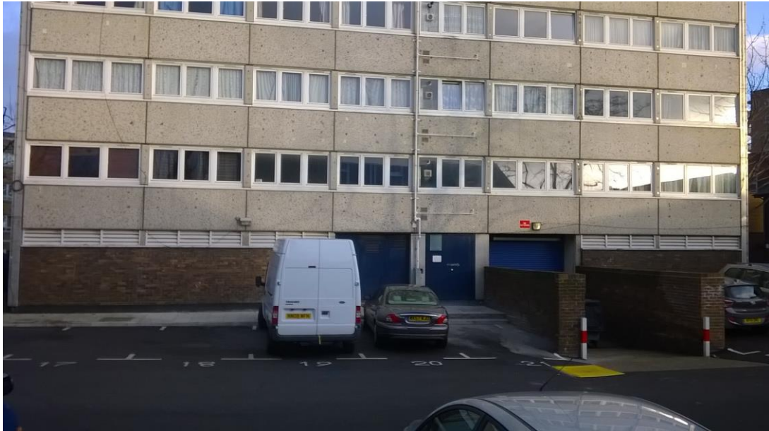
View 4: Rear Elevation of site