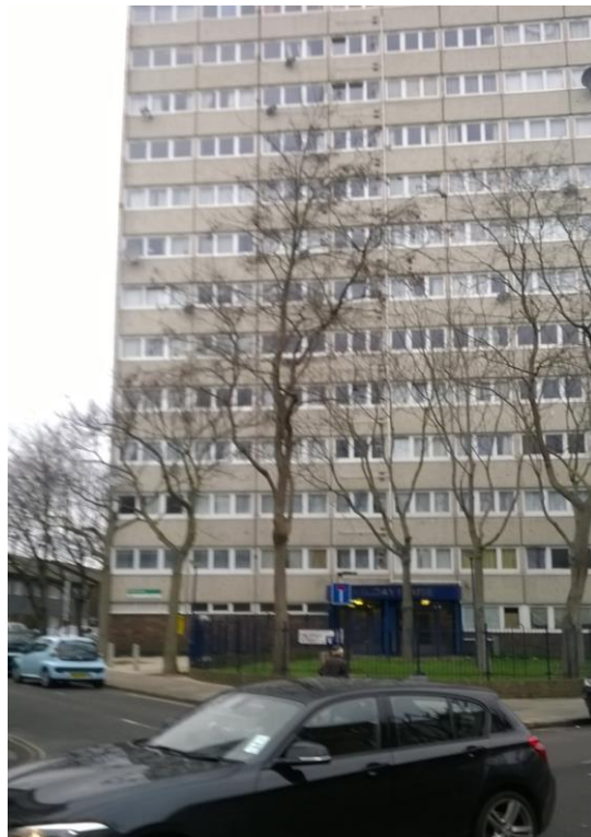
View 3: Subject site Side and Front Elevations