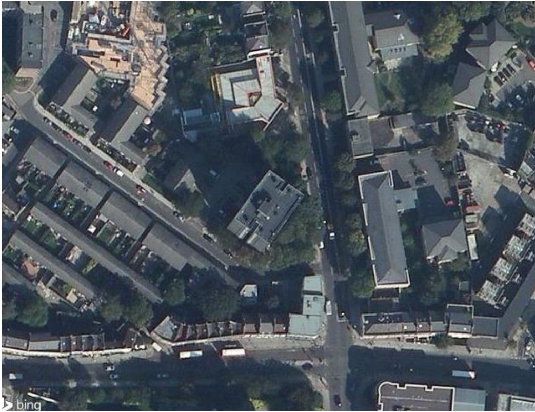
View 2: Aerial view of Haliday House