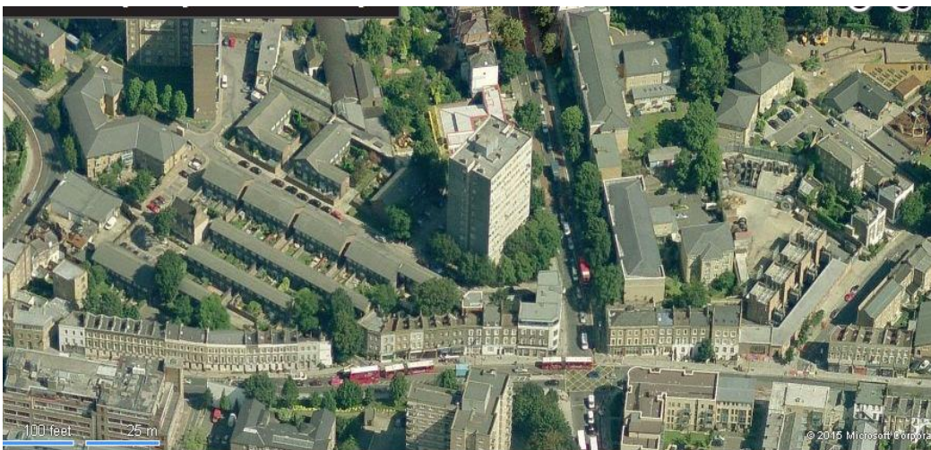
View 1: Birdseye view of Haliday House